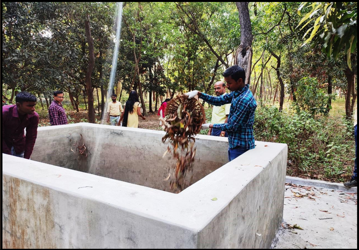
Decayed Leaves Collected in Pit to Create Manure for Vegetation