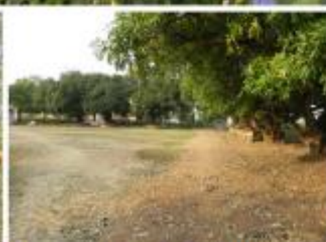
Images: Presence of Biodiversity in the College Campus